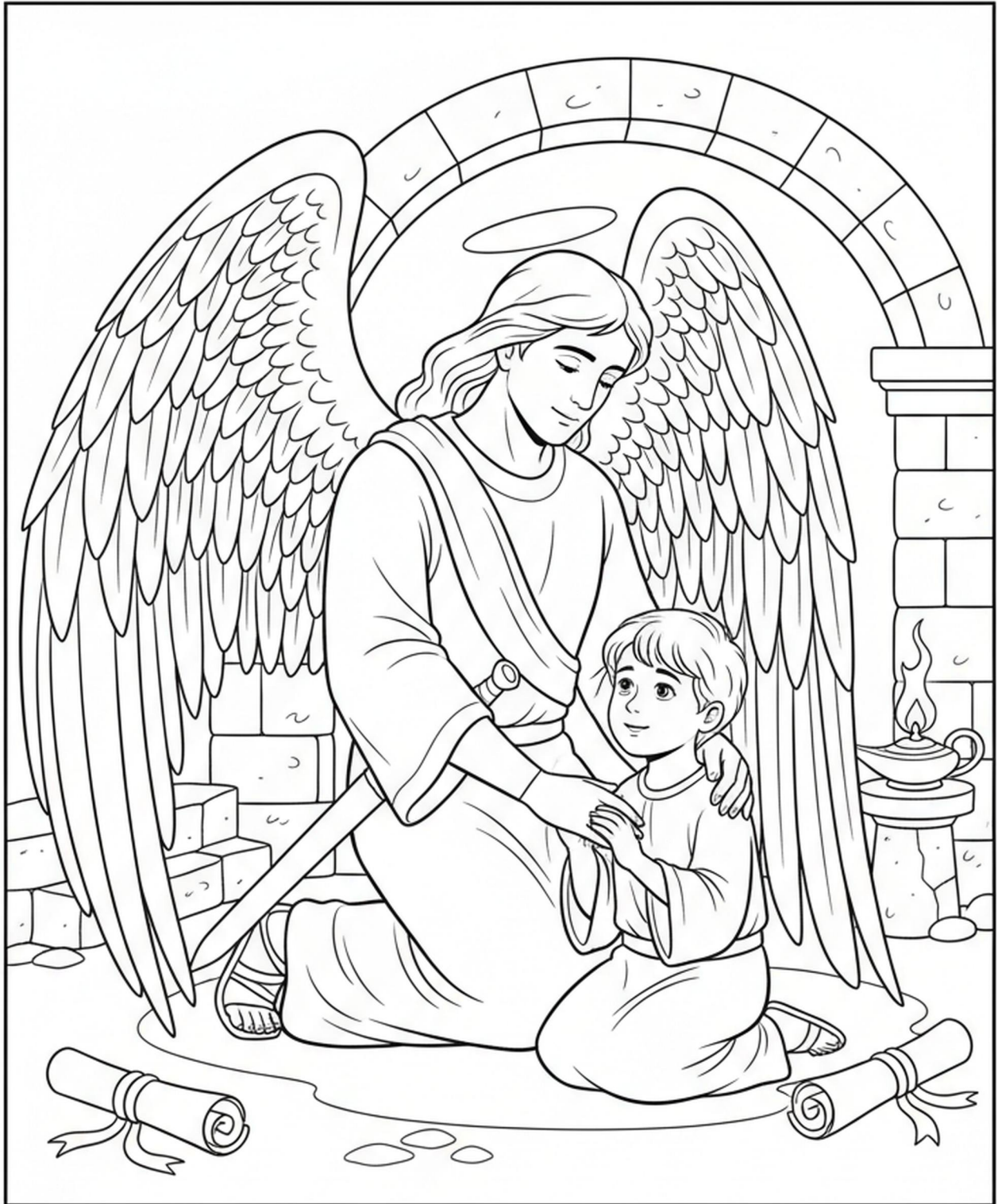
ST. MICHAEL COMFORTS A CHILD