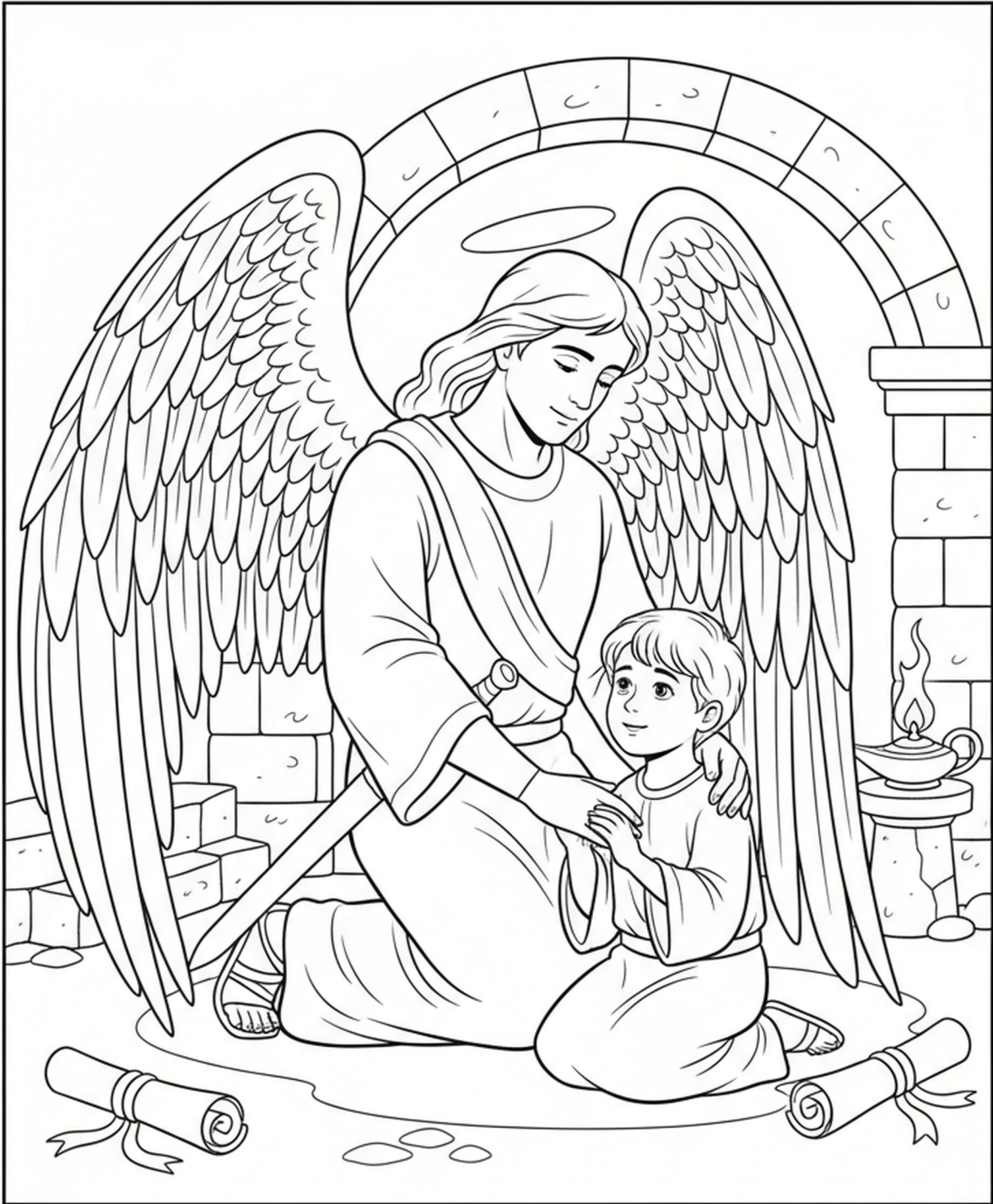
ST. MICHAEL COMFORTS A CHILD